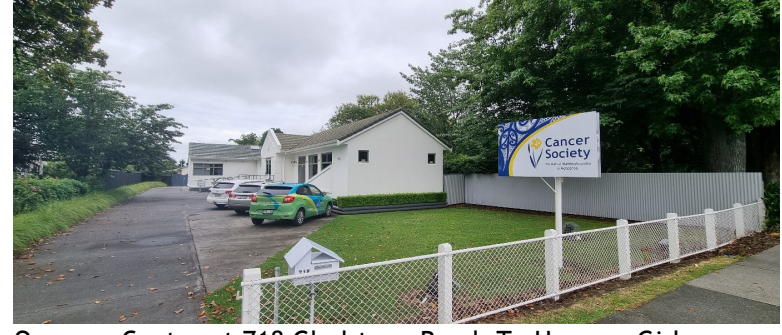
Our new Centre at 718 Gladstone Road, Te Hapara, Gisborne