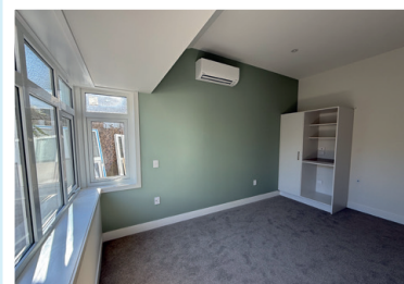
Renovations at Park Road, which will soon be open for patients