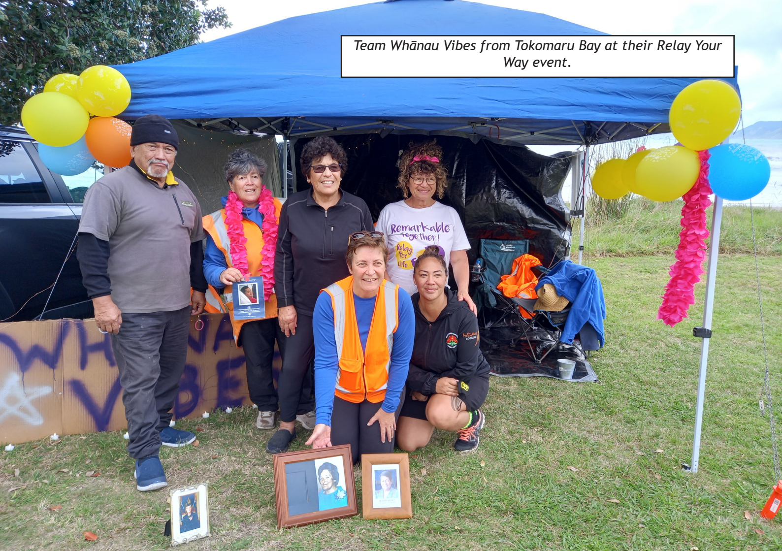
Team Whānau Vibes from Tokomaru Bay at their Relay Your Way event.