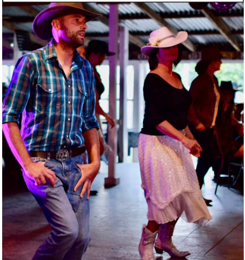
Rhythm n'Lines during their Relay Your Way three-hour Wild West Out East dance marathon.

We received 170 new referrals for Supportive Care - an increase of 63%