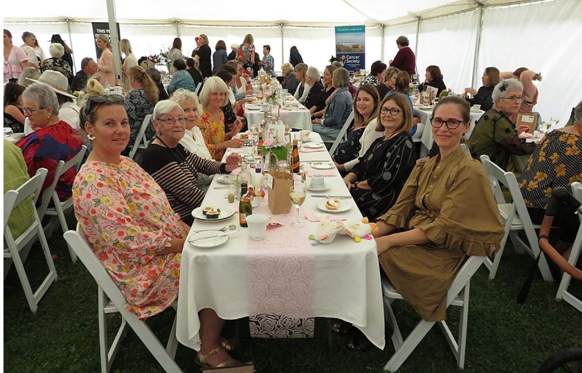
Pictured above and below; The very successful Mother's Day High Tea.