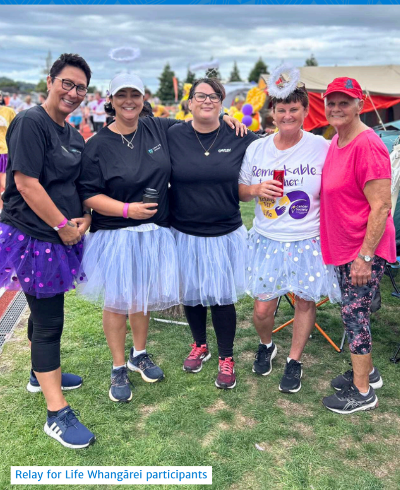
Relay for Life Whangārei participants

Overall, this year has been a successful one in the events space. Not only have crucial funds been raised for those needing support in our communities, but our events showcased our services, informed the public on how we can help, and provided our supporters with a positive and fun experience. We can't thank the wonderful fundraisers and event participants who made this year such a triumph.