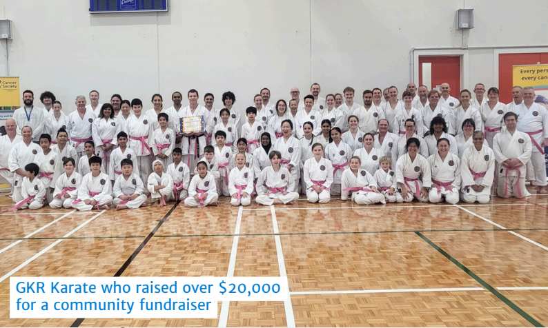
GKR Karate who raised over $20,000 for a community fundraiser