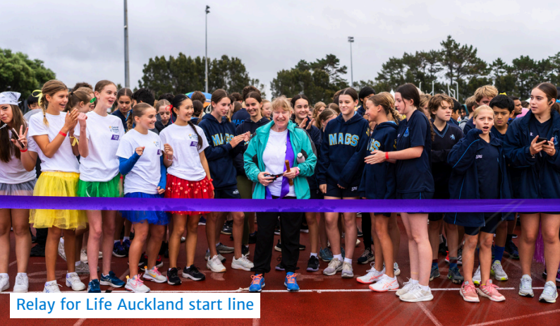
Relay for Life Auckland start line