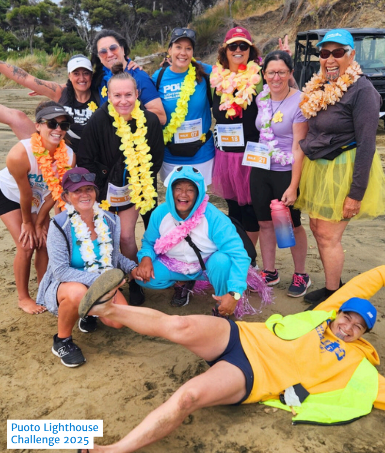
Puoto Lighthouse Challenge 2025