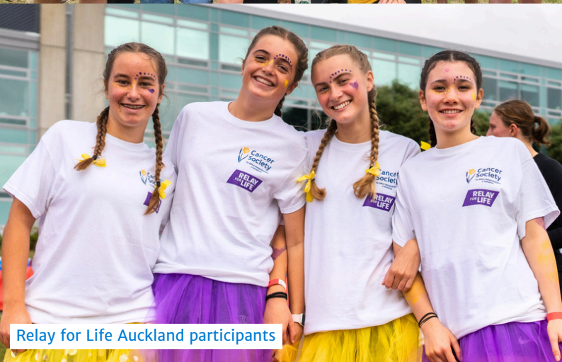
Relay for Life Auckland participants