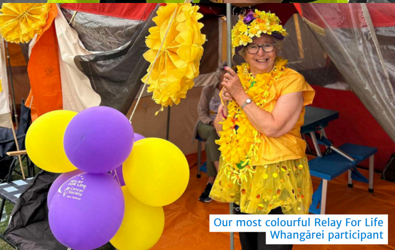
Our most colourful Relay For Life Whangārei participant