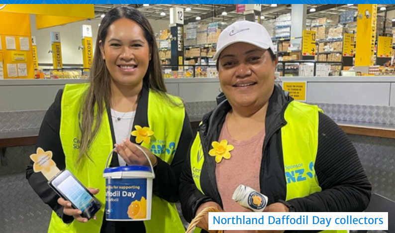
Northland Daffodil Day collectors