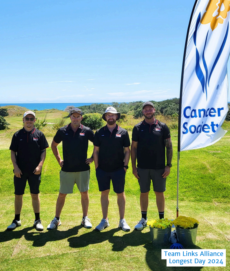
Team Links Alliance Longest Day 2024

Overall, this year has been a successful one in the events space. Not only have crucial funds been raised for those needing support in our communities, but our events showcased our services, informed the public on how we can help, and provided our supporters with a positive and fun experience. We can't thank the wonderful fundraisers and event participants who made this year such a triumph.