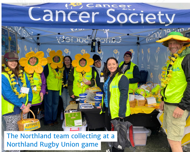
The Northland team collecting at a Northland Rugby Union game