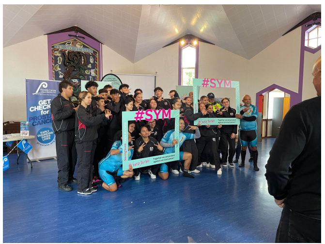
Smear Your Mea 2023