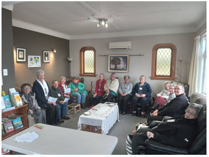
Levin Women's Support Group