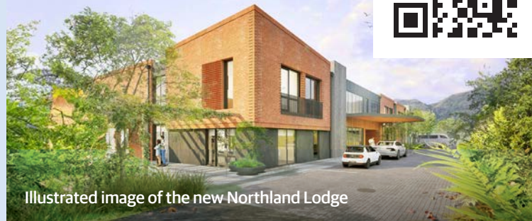
Illustrated image of the new Northland Lodge