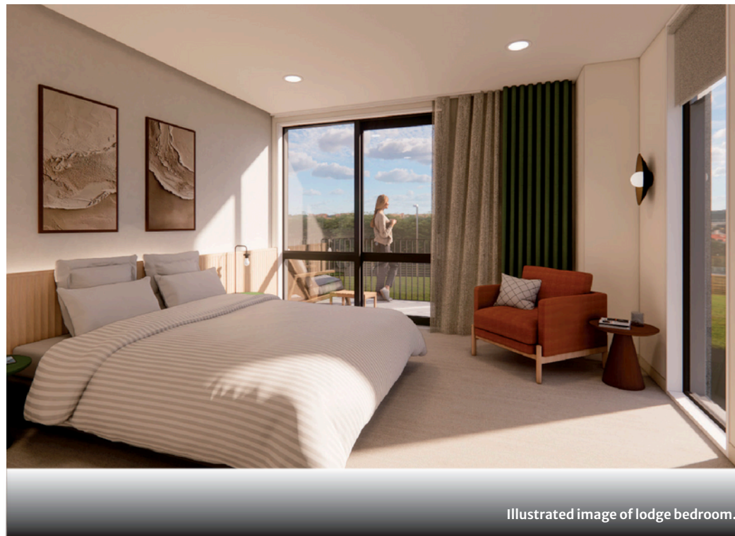
Illustrated image of lodge bedroom.