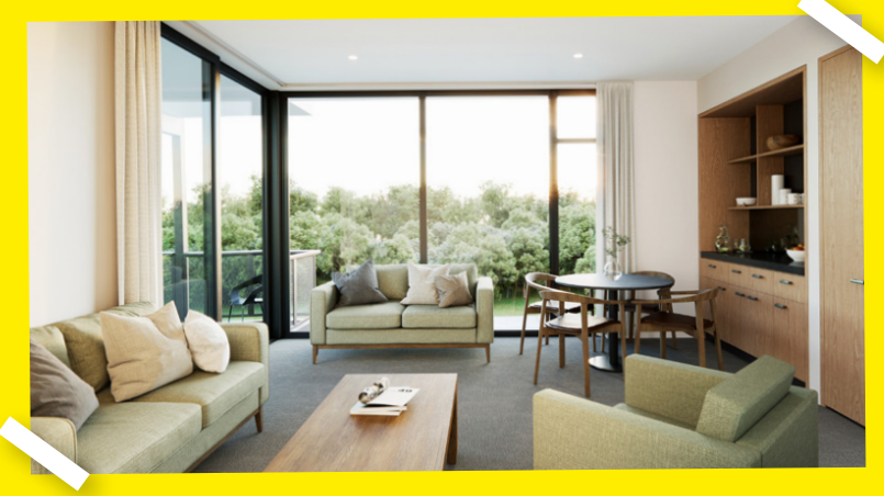
Impression of one of the centre's whānau rooms.