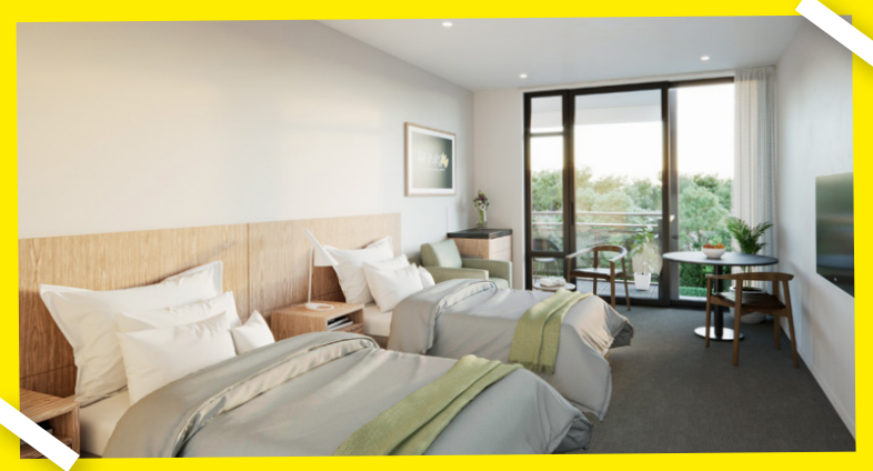
Impression of an accommodation room in the new cancer centre.