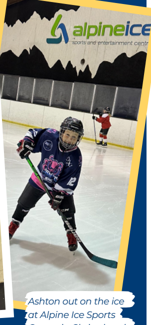
Centre in Christchurch