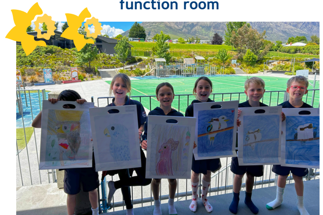
Bags of Hope proudly displayed by Remarkable students.

Where: Queenstown Events Centre, upstairs function room