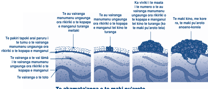
Te akamata'anga o te maki pu'aroto

Kare te au maki akapuku meitaki ua e toto'a ana ki te au tuanga o te kopapa, eiaa mei te maki pu'aroto te ka mama ua i te toto'a.