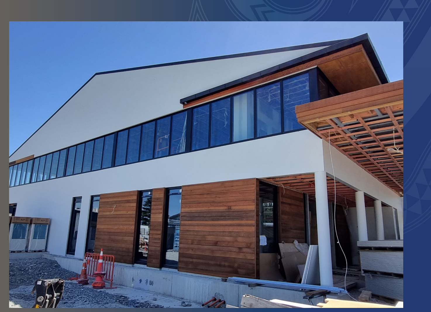
Progress on the new Canterbury Cancer Centre, February 2023

The Division remains vigilant as to how and where we spend our funds and we have kept spending below budgeted levels. Savings were achieved without any reduction in access or quality of our service provision.