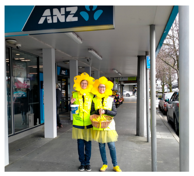
ANZ staff collecting in Rangiora for Daffodil Day