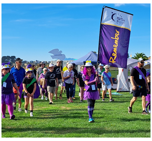
Relay For Life, Timaru, March 2023