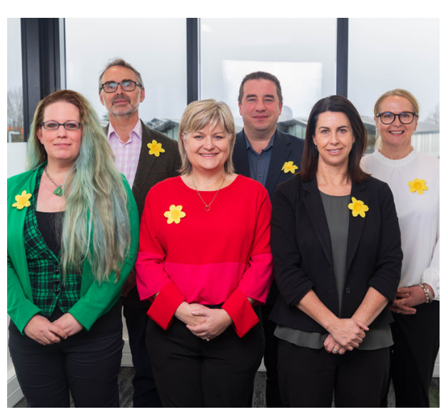
The Canterbury-West Coast Senior Leadership Team