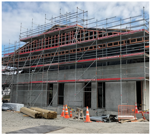
The Canterbury Cancer Centre in October 2022