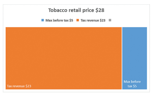
Figure 2: Example of maximum pack price before tax $5, mandated pack retail price $28 ($23 tax)

'Maximum price before tax' systems are widely used when there are private monopolies or restricted markets, as a way to protect communities. For instance, with power, fuel, communications or other networks.[96 97] This system would also be suitable for the commercial sale of an addictive dangerous product.