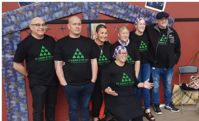
Our brave Strength of the Shave participants!

Whether it be to show solidarity for a loved one or to help raise funds, people have been picking up the clippers to support those with cancer for years. Te kaha o te heu/The Strength of the Shave event was held during July and raised a total of $8,738. What started as a fundraising event turned into an opportunity to engage our Māori community and raise awareness of health inequities throughout the cancer care continuum. Māori are 20% more likely to get cancer and nearly twice as likely as non-Māori to die from cancer, highlighting the vital role the Cancer Society plays in pursuing equal health outcomes for all. Te kaha o te heu is a worthwhile initiative as the funds raised will assist our Māori health promotions and screening initiatives.