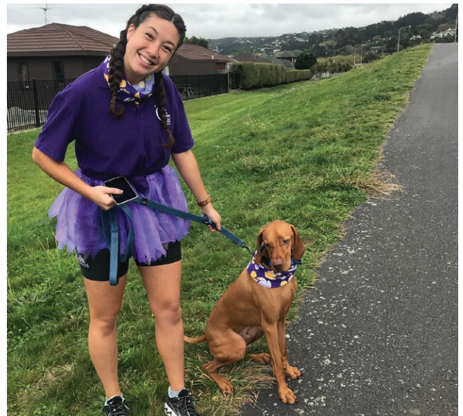
A 2020 Relay For Life participant completes their laps with a furry friend.

Wellington's 2020 Relay For Life event was held virtually, however, it did not take away from the event's spirit and community connection. Participants posted photos and videos of their laps online, and a virtual candle-light ceremony honoured those that lost their lives to cancer, and celebrated the strength of carers and survivors.