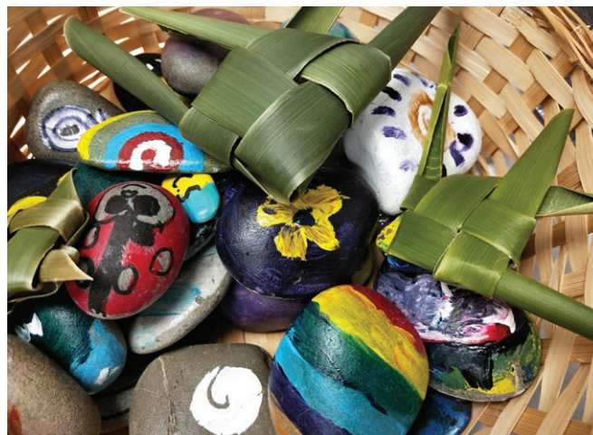
Kōhatu and harakeke.