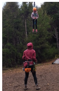
High ropes course at Rotoiti Lodge.