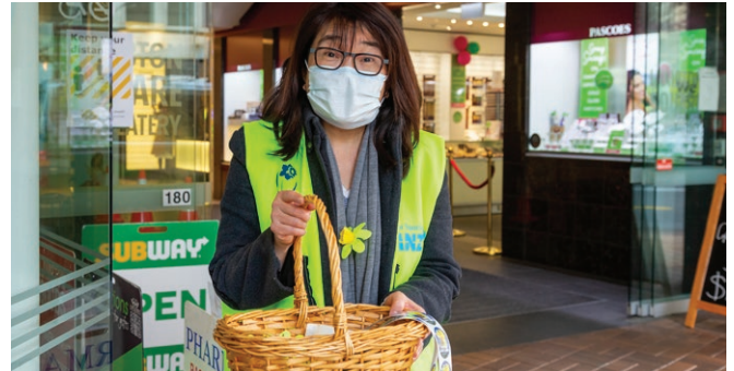
Volunteer collector during Daffodil Day 2020.

2020 marked the 30th anniversary of Daffodil Day in New Zealand. That's 30 years of coming together to raise much-needed funds to support people with cancer. Thanks to the support of our volunteers, our Daffodil Day Street appeal was able to take place in August with extra precautions under Covid-19 Level 2 restrictions. Covid-19 poses an additional risk to cancer patients, and this was recognised by our community through their generous donations in response to our appeal.