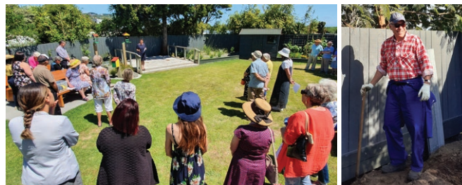
(L) Kāpiti community gathers for World Cancer Day 2021 observance. (R) Menzshed volunteer landscaping in the Support Centre garden.