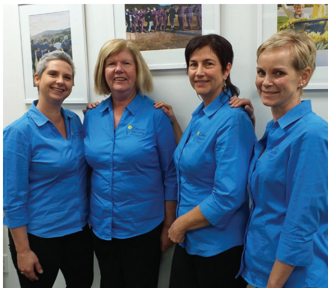
The Nelson-Tasman team.