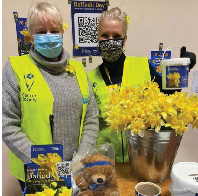
Daffodil Day 2020 pop-up shop.

Despite Covid-19 Level 2 restrictions, our 2020 Daffodil Day street appeal was the most successful to date and we received an enormous amount of