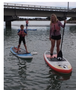
Holiday programme paddle boarding.